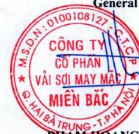
PHAM HOANG LONG